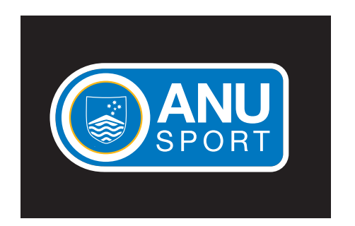
Primary logo reversed