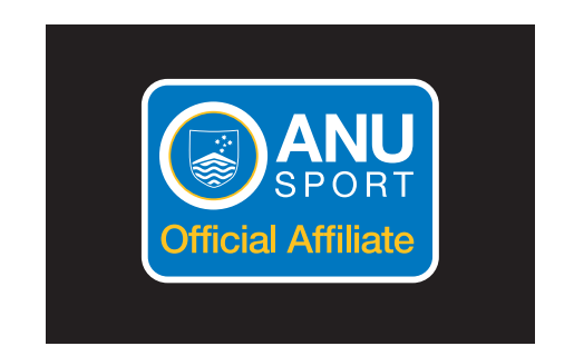
Official affiliate logo reversed